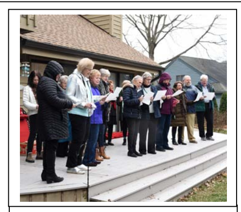
Reading of the "Sock Burning" poem