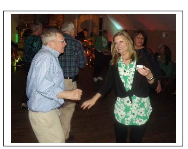
Happy Hour at Bradenton Beach, FL