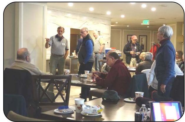
Group Photo (SH)