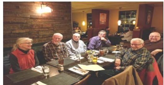
S/C PA Happy Hour Group

4 th Thursday ANNAPOLIS: Feb 28 th 5:00 - 7:00 PM New location for this month is THE GREEN TURTLE 177 Jennifer Road at West/450, in the restaurant park across from the Annapolis Mall Sears. In the front door, work your way left and at the back of the restaurant you will see the "party room". ORDER with our personal waitress! 410-266-7474 www.thegreenturtle.com CONTACT: reponce@msn.com 301-717-2770