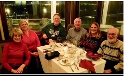
NJ/PA Happy Hour - Courtesy of Julie Fort