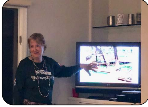
Presenting: Cruising the Zambezi Where Elephants and Hippos Come to Play.