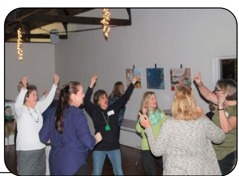
Let the <u>S.T. After</u> <u>Party</u> Begin By Gabi Van Wie