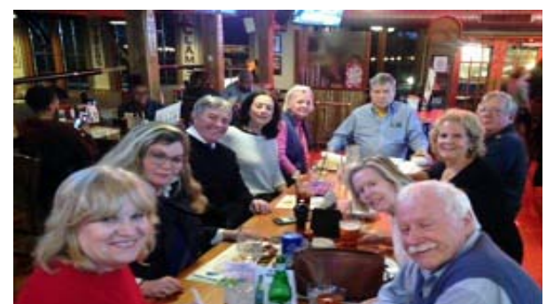
Baltimore Happy Hour

443-837-6057 (still cocojoes@comcast.net) repence@msn.com 301-717-2770 CONTACT: