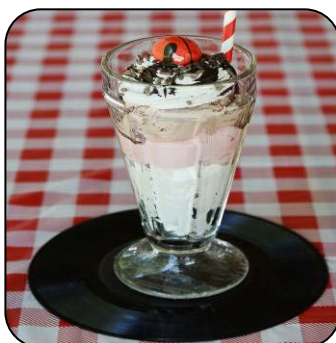
50's Ice Cream Sunday (SAW)