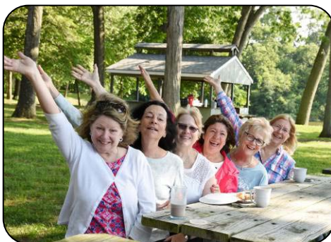
Sail-In or Drive-In You are Welcome here. (Names Below)