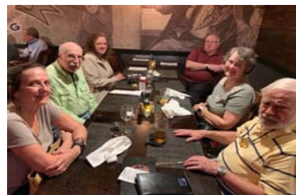
South/Central, PA

ANNAPOLIS: June 27 th 5:00-7:00 PM THE PIER 48 South River Rd, Edgewater, MD If we are not in the bar area, we'd probably be on the UPPER deck outside. 443-837-6057 (still cocojoes@comcast.net ) CONTACT: repace@msn.com 301-717-2770