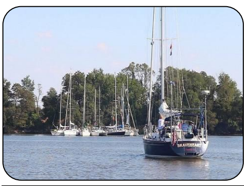
s/v BRAVEHEART approaching the raft-up (RAG)