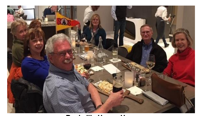
Rockville Happy Hour

outside. 443-837-6057 (still cocojoes@comcast.net) CONTACT: repence@msn.com 301-717-2770