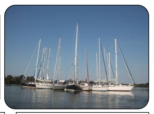
The Raft-Up (GVW)