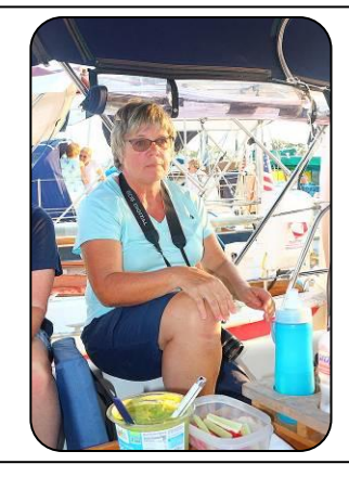
Whisker Pole