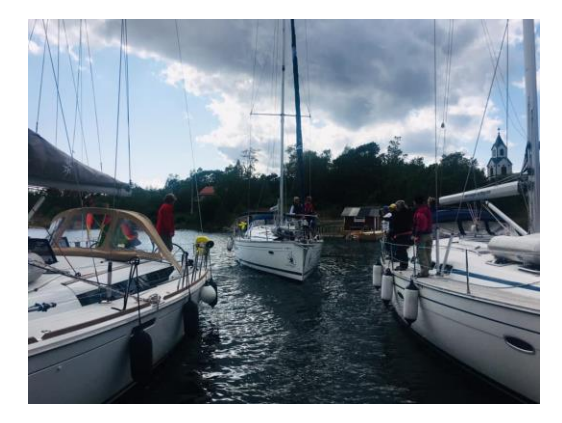
Skipper Emil Becker and crew squeezing into slip at Moja, Sweden.