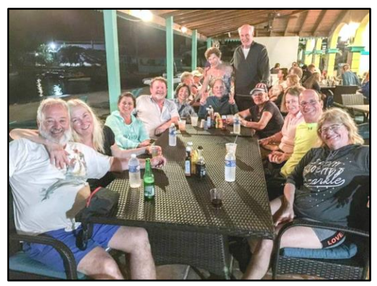
Crew from three SOS chartered boats enjoy a crew dinner at Leverick Bay, BVIs.