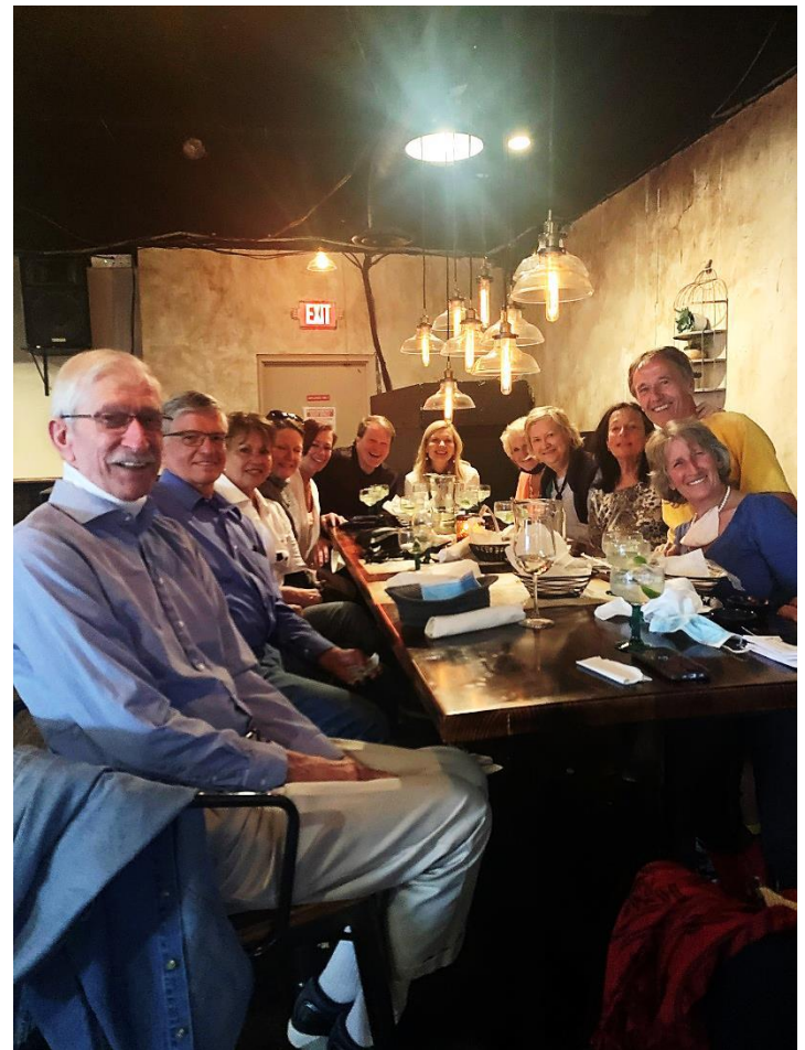
Ellicott City Happy Hour- April 2021

4 th Thursday ANNAPOLIS: June 24 th 5:00-7:00 PM THE PIER 48 South River Rd, Edgewater, MD. Rt. 2 on south side of South River Bridge. If we not in the bar area, will be on UPPER deck outside. 443-837-6057 cocojoes@comcast.net COORDINATOR: repence@msn.com