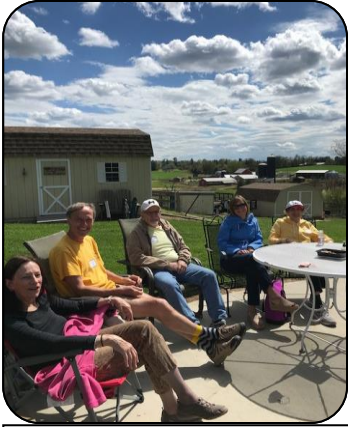
Western Howard County