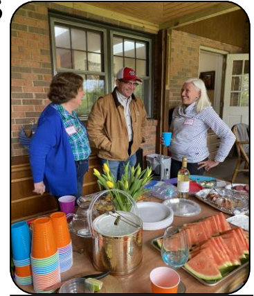
Great Falls, VA