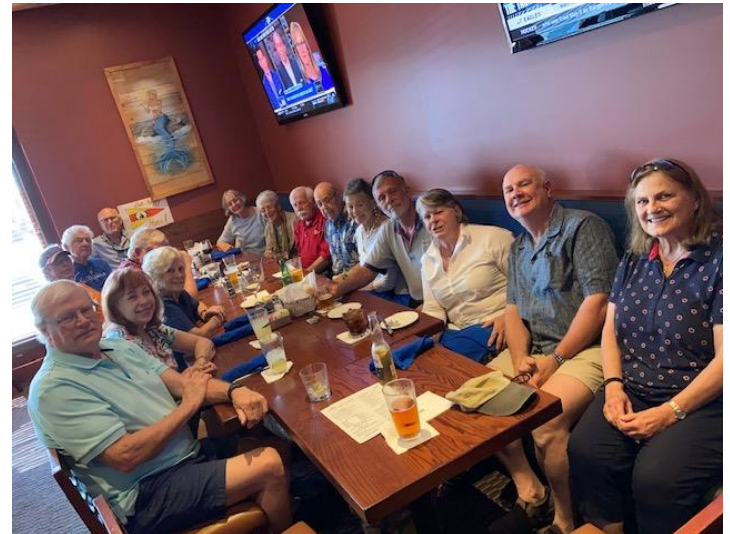
Kent Island Happy Hour- June 2021

4 th Thursday ANNAPOLIS: Aug 26th 5:00-7:00 PM THE PIER , 48 South River Rd, Edgewater, MD. Rt. 2 on south side of South River Bridge. If we are not in the bar area, we will be on the UPPER deck outside. 443-837-6057 cocojoes@comcast.net COORDINATOR: RON- reponce@msn.com