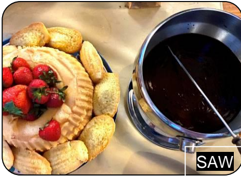
Co-Star of the Cruise: Chocolate! Wine elsewhere just CHILLING!