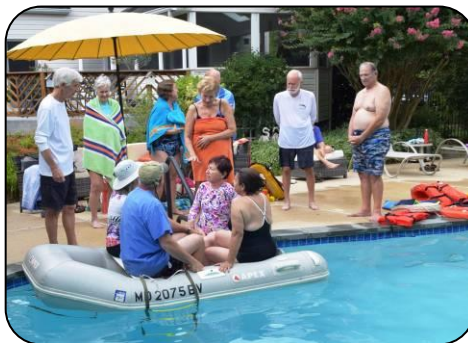
Four in a Dinghy. (This doesn't look HARD).