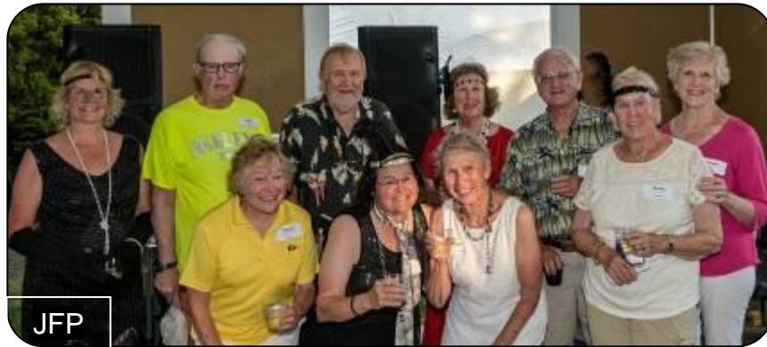
Past Commodores (present at party)