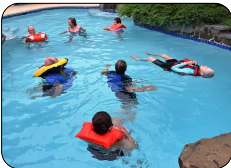
Everyone learns how difficult it is to put on PFD in water