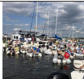
Shaw Bay Concert 2020

After the concert it is skipper's choice to remain in the anchorage overnight or move elsewhere to anchor before dark. Then it's heading for home on Sunday.