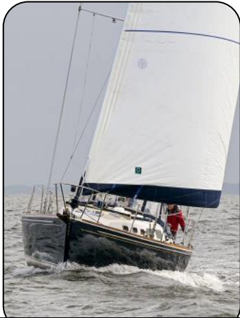
Sail Away carrying the Raft Captain