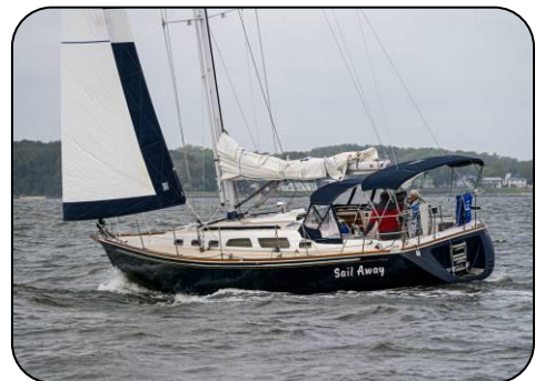
Sail Away, carrying the Raft Captain saying "My job is done"

** - Not positive on the name. Any errors will be corrected in the following issue.