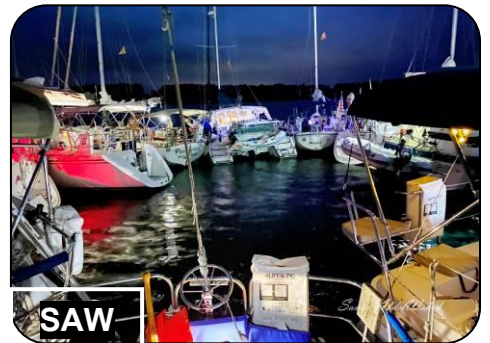
The Is Raft Closed