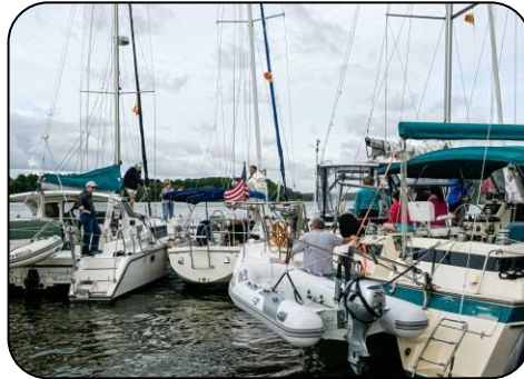
Building the Raft