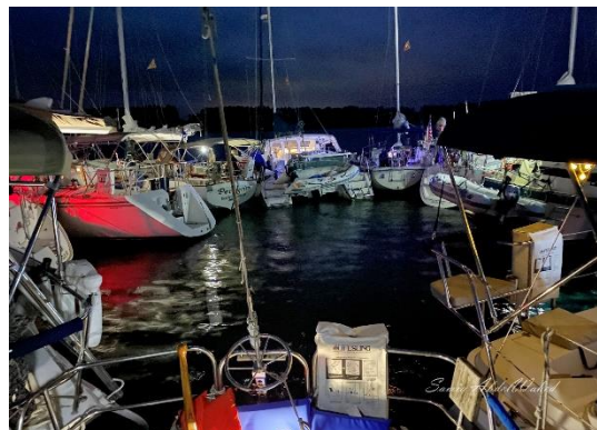
Nighttime Circle Raft by Samia Abdelwahed

The first boat they played with dropped their anchor and tied up in the raft only to learn that the mischievous gods spit his anchor out of the mud and the boat had to leave the raft to reset. With the help of an added skipper who jumped on board to lend a hand, they thumbed their noses at the gods and got that anchor to hold. That delayed raft building a bit.