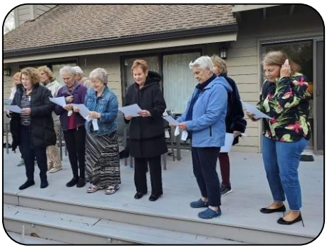
The Group reciting poem before burning socks.

NOTE FROM PHOTO EDITOR: Please include names with your photos so we can learn everyone's names.