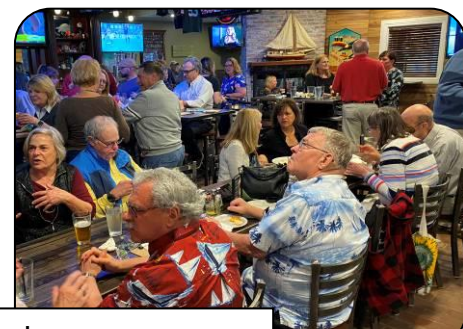
Meet and Greet – GROUP Photographs by Samia AbdelWahed