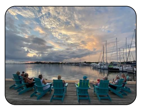
1<sup>st</sup> Place PEOPLE: Samia AbdelWahed