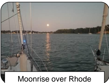
Moonrise over Rhode River