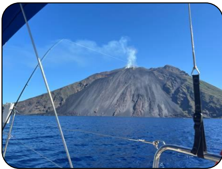
Island of Vulcano, by Marge Stembel