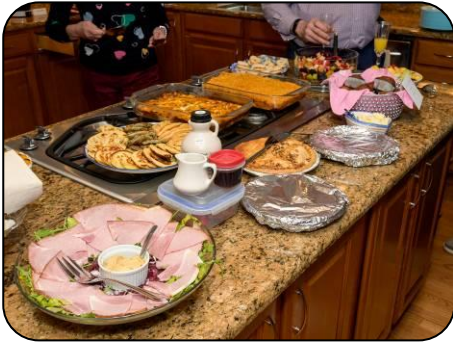
Brunch Food – Yum!