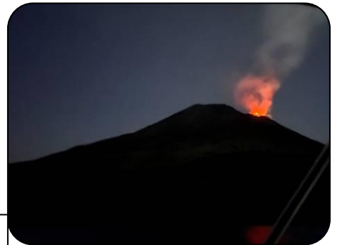
Island of Vulcano, by Marge Stembel