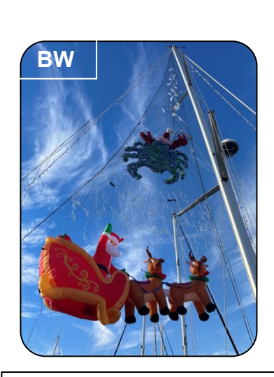
Progress being made.