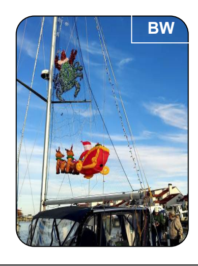
Nearing the end of the work