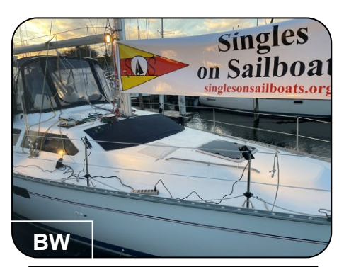
At Last – "Best in Show" Skipper - Chuck Fort