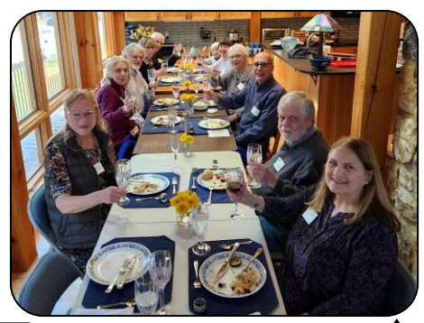
Delaware Brunch: By Chuck Fort