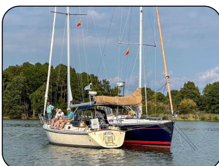
S/V Skylark and S/V Sea Tango