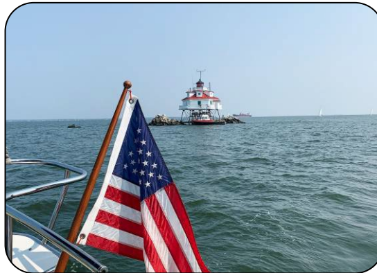
1 st Prize "BAY SCENES" Tina Lavato