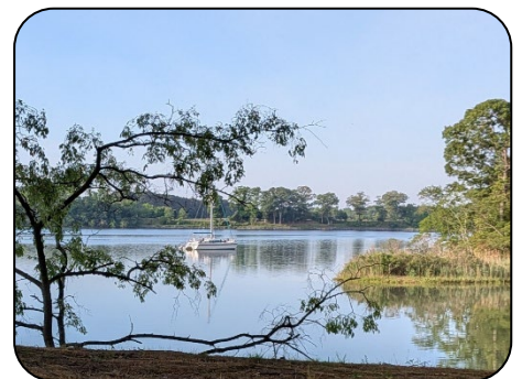
S/V Hedy at anchor