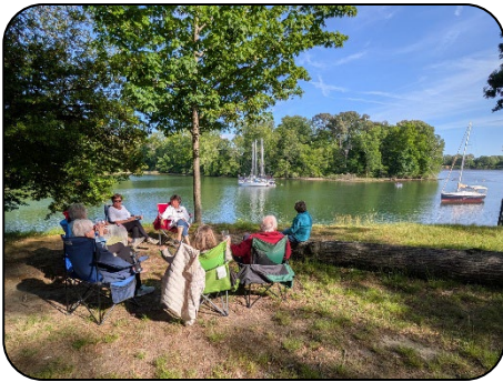
Mid-afternoon rest and sunshine