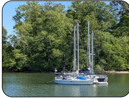
First Raft-Up in Granary Creek