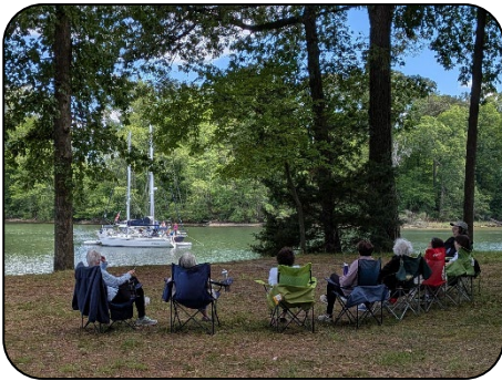
The "Set-Up Crew" relaxing before the rush of work by Bob Wright