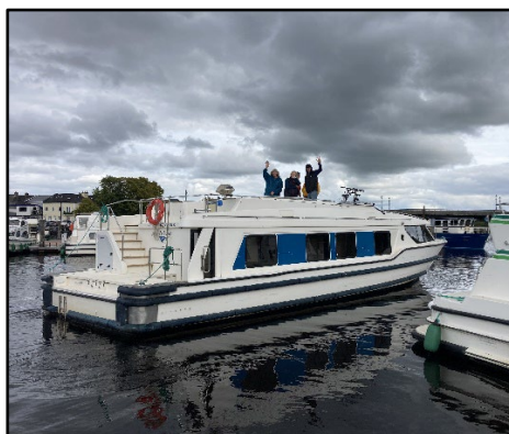
A Le Boat "Barge"

The SOS Board has approved our Fall 2026 Bareboat trip - 7 days (September 5 – 12 th ) cruising down the River Shannon from Carrick-on-Shannon to Portumna. It's about 100 miles (160 kilometers), with a cruising time of about 20 hours, including 5 locks and 2 bridges, and a half-dozen-plus villages and towns worthy of exploration along the way.