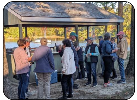
SOS Happy Hour