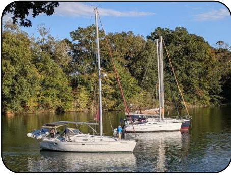
Coney Island arriving, with Satori and Sea Tango